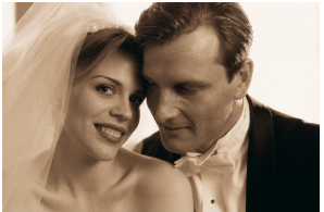
The most important partnership in life

St. Michael's Church values relationships and commitments highly. It is vital that those seeking to be married should receive good pre-marriage education and on-going encouragement. It is also important for couples to understand what it means to ask for marriage in a Christian tradition.