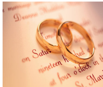
Good preparation is vital

Usually held in the week prior to the wedding the rehearsal is