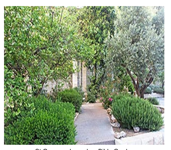
St Georges Jerusalem Bible Garden