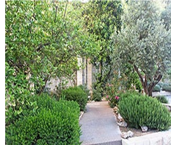
St Georges Jerusalem Bible Garden